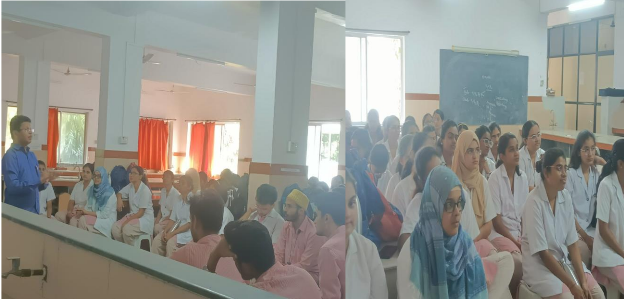
PHOTO – INTERNATIONAL GIRL CHILD DAY