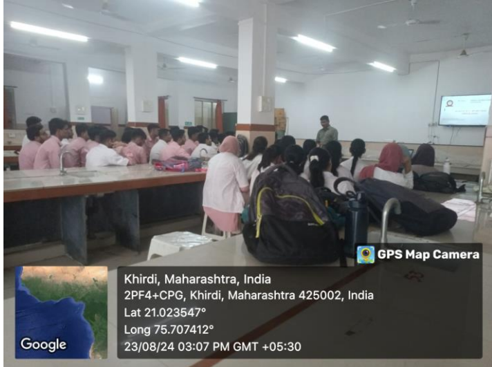
PHOTO - PLASTIC BAN AWARENESS