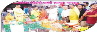
आधुनिक मंडिरापी बाह्यी कलातुा माध्यम

जळगाव - डॉ. उल्हास पाटील वैद्यकीय महाविद्यालयात 'सोव समन्वय २०२४' चे आयोजन करण्यात आले होते. या उपक्रमांतर्गत विद्यार्थ्यांनी कलाकुतीच्या माध्यमातून अनेक युग साकारले. लसेच आर्ट गॅलरीच्या माध्यमातूनही प्रसिध्द व्यक्तींची बोलकी छायाचित्रे शेकावली. युवा विद्यार्थी प्रोग्रामिंगमध्ये विद्यार्थ्यांनी विविध गीते सादर करून मनपुराद आनंद सुटला.